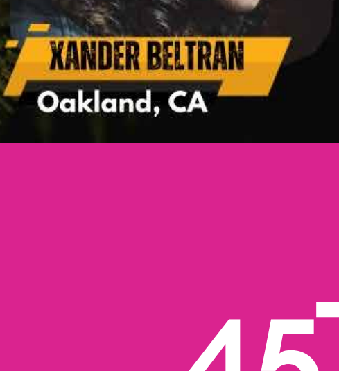
XANDER BELTRAN Oakland, CA